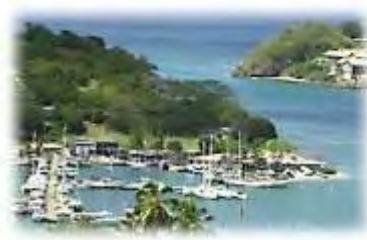
Delightful Harbor Views