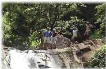
Hiking in the Rain Forest

There's so much to see here. A tour of the island is a must to see the mountains, vistas, crater lakes, rainforests, and the huge market in town. Two days will give us ample opportunity to sample some of what this island has to offer.