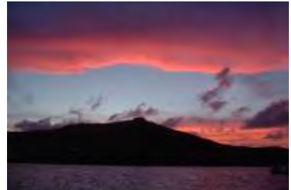
Sunsets like no other