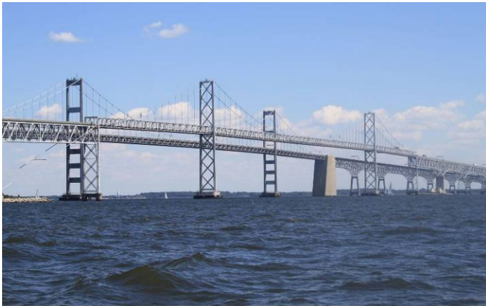
Chesapeake Bay Bridge

Protected waters, great anchorages, gorgeous natural scenery, unique towns and villages, and a forgiving bottom make the Chesapeake Bay and the Chester River are excellent choices for sailors.