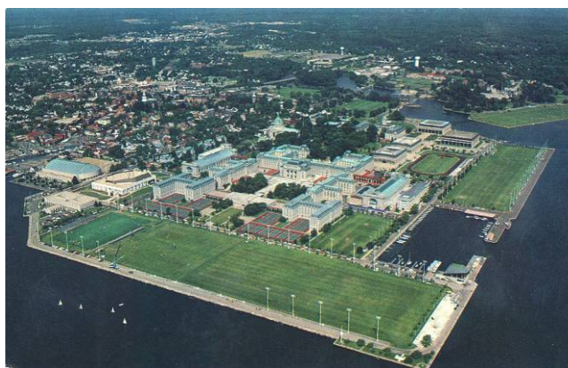
Aerial View of the Naval Academy at Annapolis

We'll board our boats at Haven Harbor Marina in Rock Hall, Maryland, on Thursday afternoon, June 4th and set sail Friday morning for a destination up the Chester River, possibly Langford Creek or the Corsica River. The Chester River is the second longest river on the Eastern Shore and is bordered along much its shoreline by beautiful rolling countryside and lovely estates. By sailing south from Rock Hall and then north up the Chester, we should be able to experience nearly every point of sail on our journey. Once we reach our anchorage and are rafted up, we'll enjoy an appetizer party and possibly a game of cards before retiring for the evening.