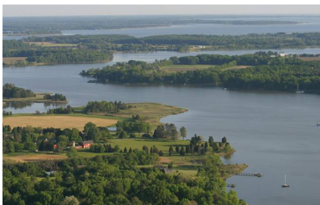
Aerial View of the Chester River

Protected waters, great anchorages, gorgeous natural scenery, unique towns and villages, and a forgiving bottom make the Chesapeake Bay and the Chester River are excellent choices for sailors.