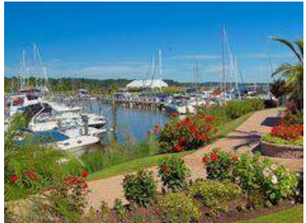
Herrington Harbor South Marina

We'll board our boats at Haven Harbor Marina in Rock Hall, Maryland, on Sunday afternoon, June 7th and set sail Monday morning for a destination down Chesapeake Bay, possibly Tilghman Creek off the Miles River or Shaw Bay on the Wye River (about 20 miles). On our sail south, we'll pass under the Chesapeake Bay Bridge, pass Annapolis and Thomas Point Light on our starboard side, then turn to port around Bloody Point on the south end of Kent Island. Once we reach our anchorage and are rafted up with the other boat, we'll enjoy an appetizer party and possibly a game of cards before retiring for the evening.