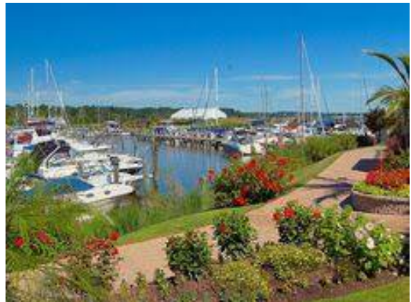
Herrington Harbor South Marina

We'll board our boats at Haven Harbor Marina in Rock Hall, Maryland, on Sunday afternoon, October 17th and set sail Monday morning for a destination down Chesapeake Bay, possibly Tilghman Creek off the Miles River or Shaw Bay on the Wye River (about 20 miles). On our sail south, we'll pass under the Chesapeake Bay Bridge, pass Annapolis and Thomas Point Light on our starboard side, then turn to port around Bloody Point on the south end of Kent Island. Once we reach our anchorage and are rafted up with the other boat, we'll enjoy an appetizer party and possibly a game of cards before retiring for the evening.