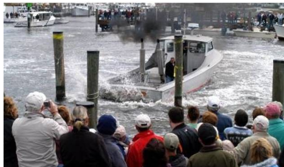
Watermen's Boat Docking Contest

It's a short walk between the docking contest and the jigger toss. Both contests are crowd favorites, providing lots of excitement, splashing and encouraging shouts. Right about this point in time your stomach reminds you it's lunch time, and your brain clicks in with the knowledge that there's a whole lot of freshly prepared food waiting! Some favor the crab soup at the local church, others head back to the firehouse for steamed crabs, crab cakes, raw and steamed oysters, oyster stew and fried clams. There are also hot dogs, burgers, fries, barbequed chicken, cookies, cakes and ice cream! Don't forget to try the oyster shooters and a cold beverage of your choice to prepare for the band starting up at Kronsberg Park where the music is made for dancing!